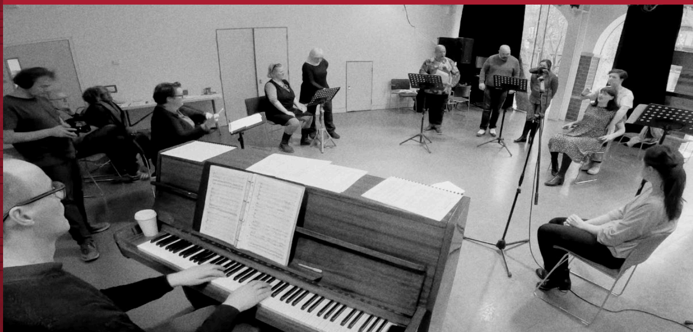
A development workshop of The Paradis Files