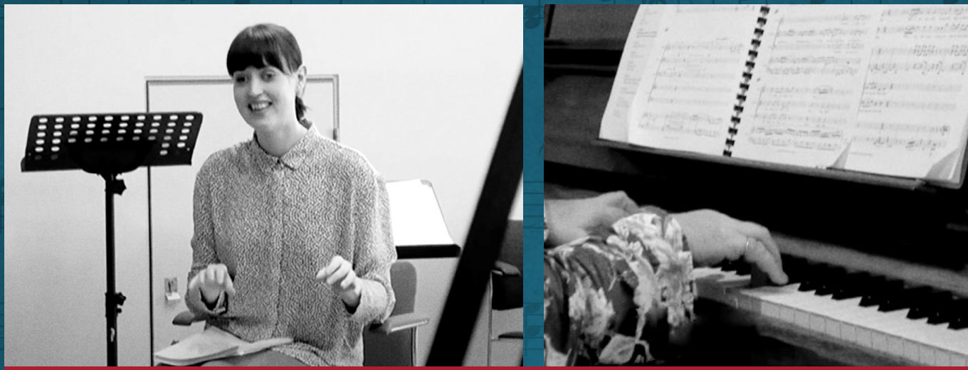
The Paradis Files in rehearsal

Through the creation of this striking new piece of work, Graeae will celebrate disabled artists and open up opera to new audiences. Directed by Jenny Sealey MBE, co-director of the London 2012 Paralympic Opening Ceremony, and with leading-composer Errollyn Wallen CBE, this beautiful production with its striking evocation of 18th Century musical life, is designed to be toured worldwide. The project includes: the opera production, its digital presentation and accompanying community outreach.