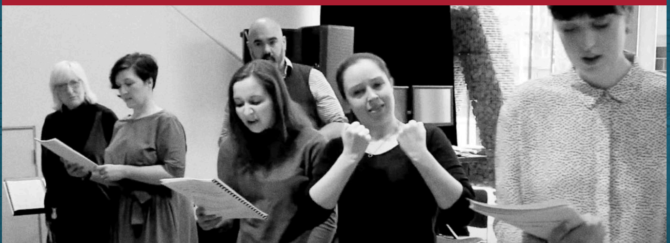
A development workshop of The Paradis Files

This new opera will share the life of an astonishing artist who was both manipulated and deified, but who succeeded in controlling her own destiny, achieving fame and a career in music; fighting for her talent to be acknowledged and judged on its own terms.