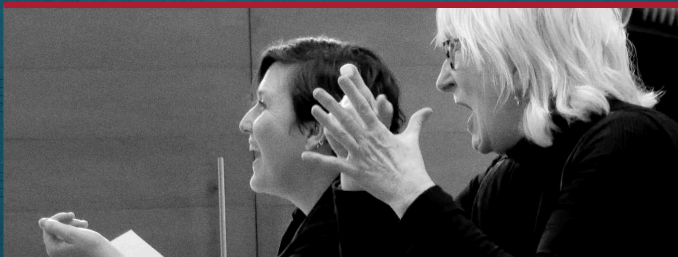
A development workshop of The Paradis Files

The project will draw on Graeae's considerable collective experience to build a robust and accessible engagement programme around this ground-breaking opera. Given the ever-changing Covid-19 situation, plans are not confirmed yet. Graeae also wants to reach traditional opera audiences and give those who might not be able to attend a performance in-person, the chance to engage with the opera and its creation.