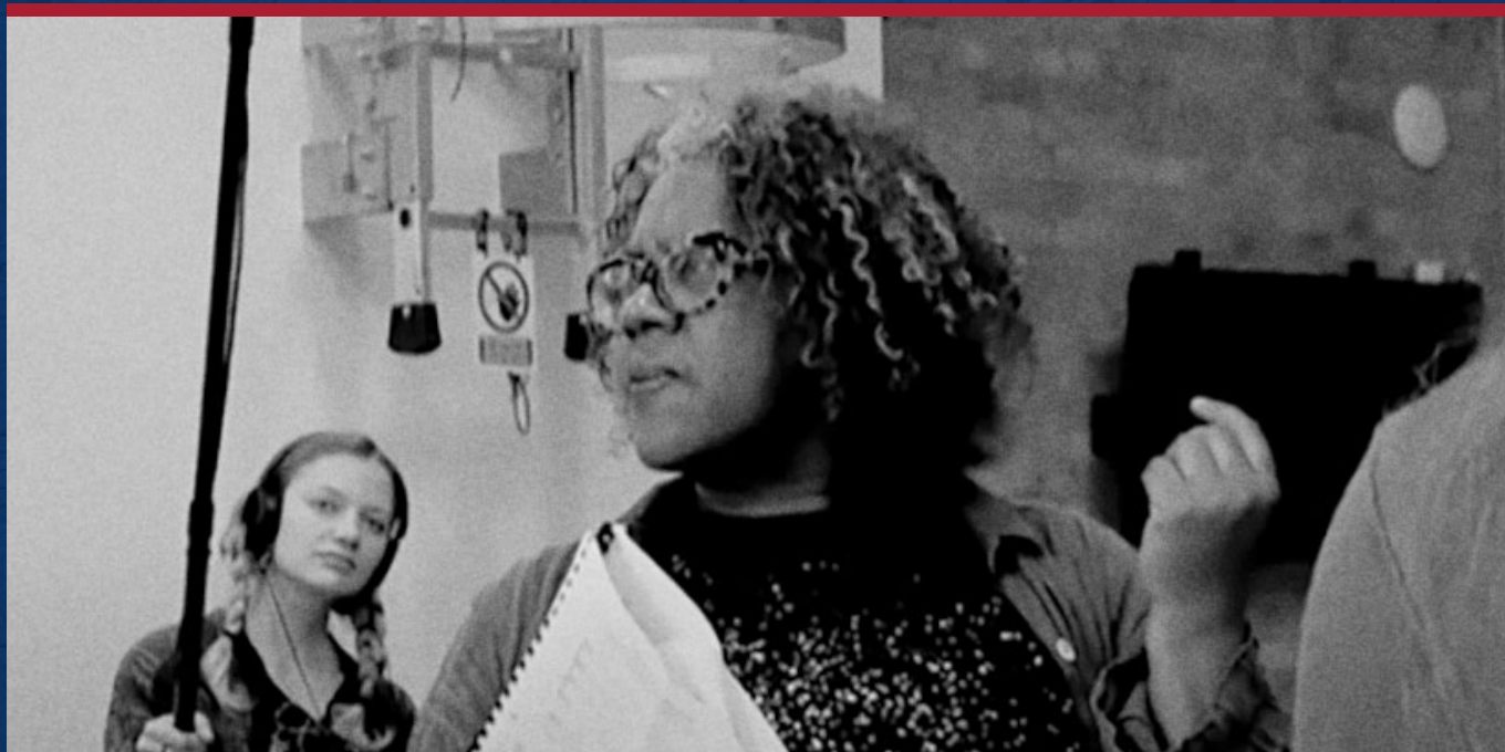
Errollyn Wallen (composer) in rehearsals

The narrative itself, the comparisons for Deaf and disabled artists then and now, twinned with the artistic team and its accessible process, is inspiring and will be leading the way for similar productions in the future. Graeae will work with partners from the opera industry who want to become more inclusive in their practice, onstage, backstage and front-of-house.