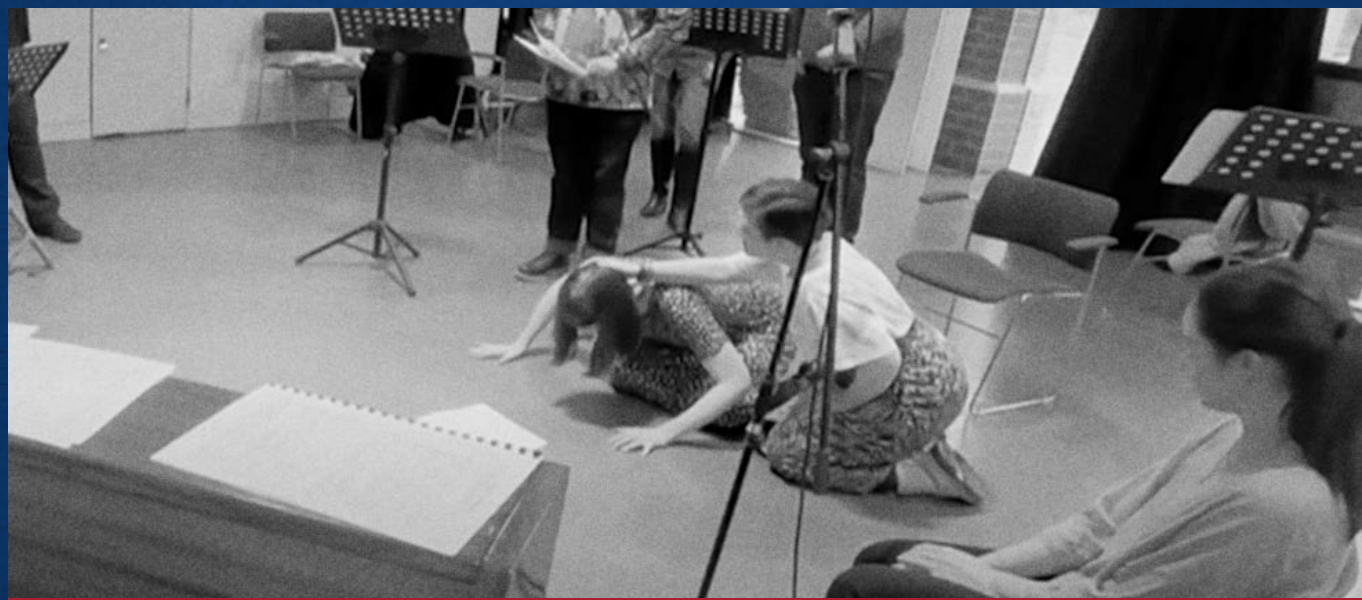
A development workshop of The Paradis Files

This project will enable Graeae to find new audiences for its work and find new communities for opera through its outreach activity.