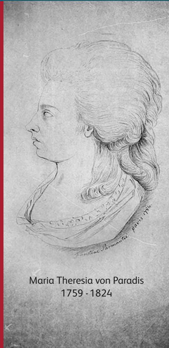
Maria Theresia von Paradis 1759 - 1824

This new opera will capture the emotional relationships of her dramatic life, reveal the impact of her talent on those around her and explore how she owned her destiny.