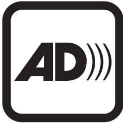
Audio Described event