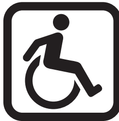
Disability access services / wheelchair accessible venue or space