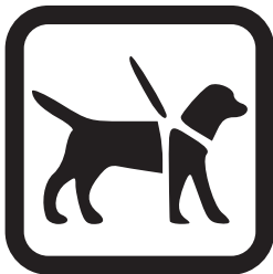
Assistance dogs welcomed