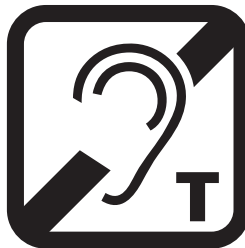
Hearing loop available